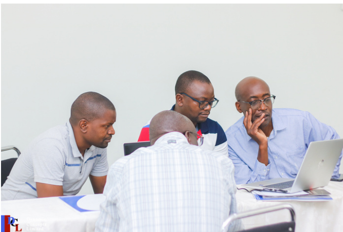
During the Development of the 2024-2028 Strategic Plan for Nitrogen Chemicals of Zambia