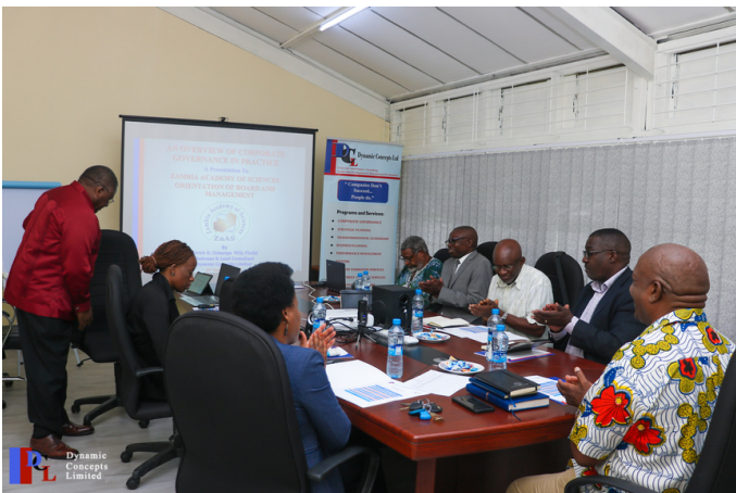
During the Zambia Academy of Sciences Corporate Governance Training workshop