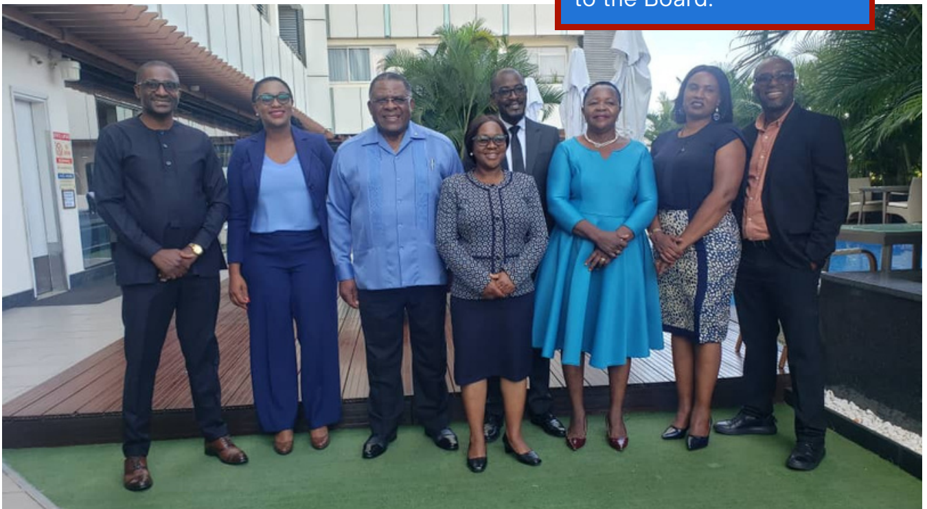
ZAMBIA AIRPORTS CORPORATION LIMITED BOARD COMMITTEE MEMBERS

Board Committees ideally serves the purpose of making recommendations to the Board.