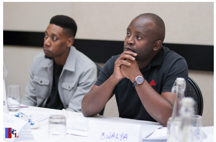
During the ZCCM-IH Team Building workshop