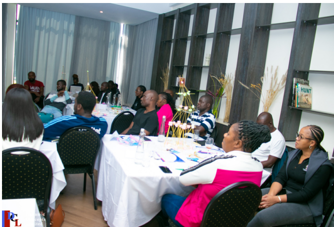
During the ZCCM-IH Team Building workshop