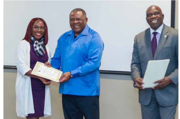
During the NHIMA Corporate Governance Training workshop