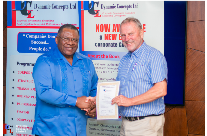
During the Board Induction Training of the Board of Zambia National Farmers Union