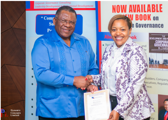
During the Board Induction Training of the Board of Zambia National Farmers Union