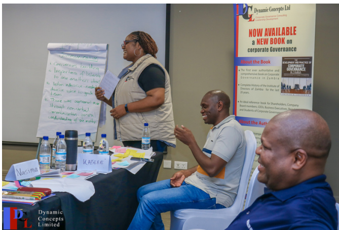
During the Energy Regulation Board Team Building workshop