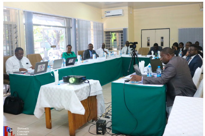
During the ZAMCOM Corporate Governance Training workshop