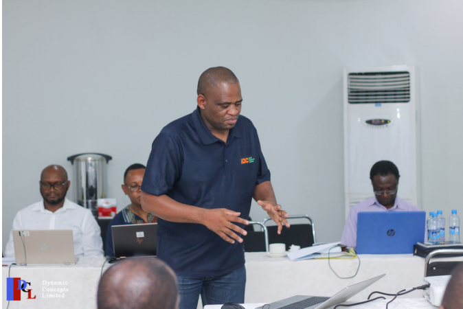
During the development of the 2024-2028 Strategic Plan for Nitrogen Chemicals of Zambia