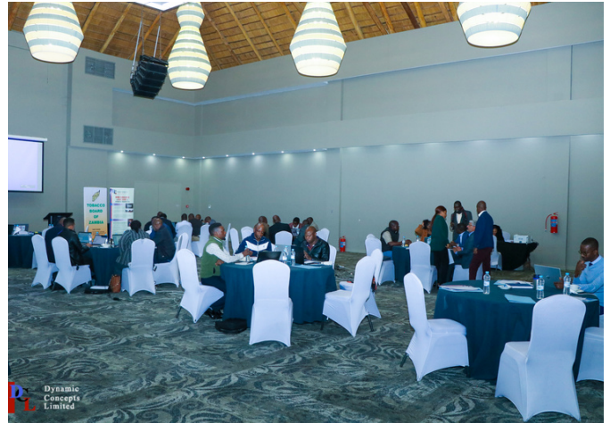
During the development of the 2024-2028 Strategic Plan for Tobacco Board of Zambia