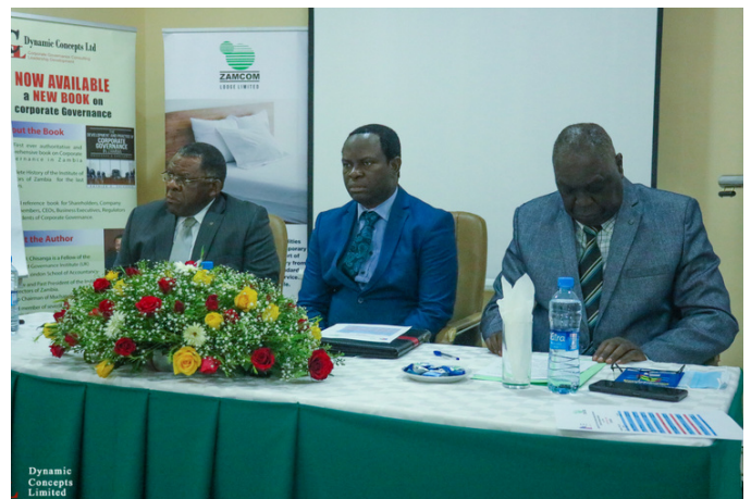
During the ZAMCOM Corporate Governance Training workshop